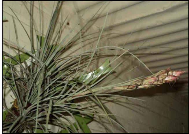
Til. x floridana